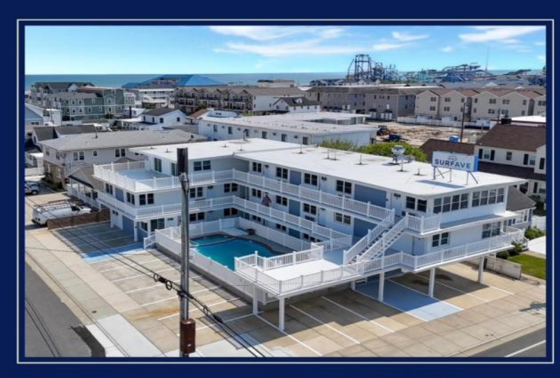
2001 Surf Avenue North Wildwood NJ Surf Avenue Suites