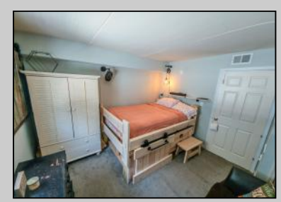
2409 Central North Wildwood, NJ 08260