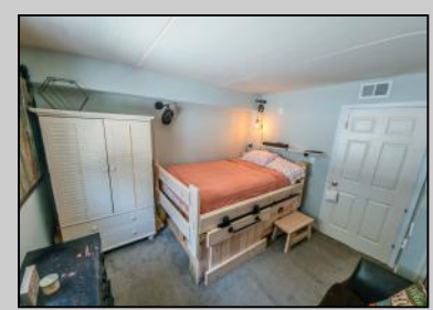
2409 Central North Wildwood, NJ 08260