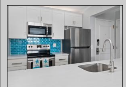
9907 Seapointe Lower Township, NJ 08260