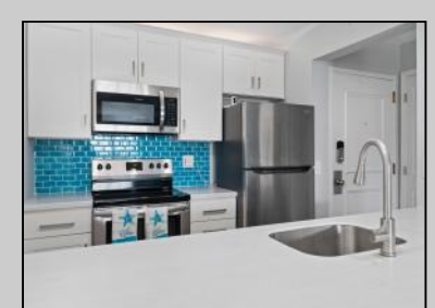
9907 Seapointe Lower Township, NJ 08260