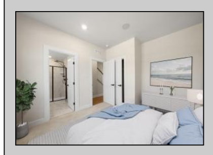
2 Waterford Cape May Court House, NJ 08210