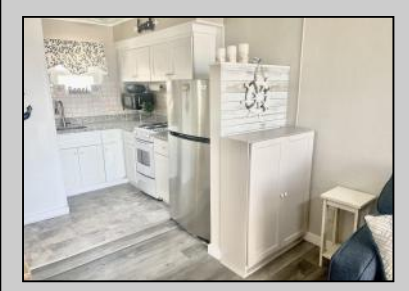
1200 Kennedy North Wildwood, NJ 08260