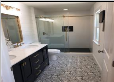
445 Dias Creek Cape May Court House, NJ 08210