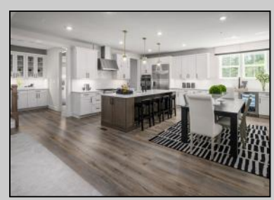
217 Muirhead Cape May Court House, NJ 08210