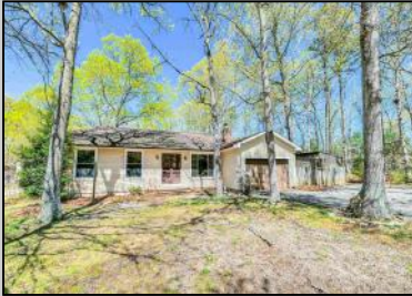
8 Sheila Seaville, NJ 08230