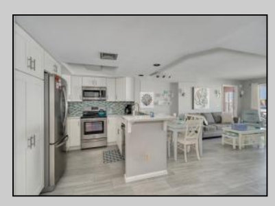
9901 Seapointe Lower Township, NJ 08260