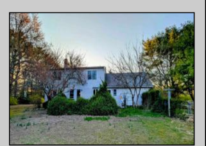
61 Perry Petersburg, NJ 08270