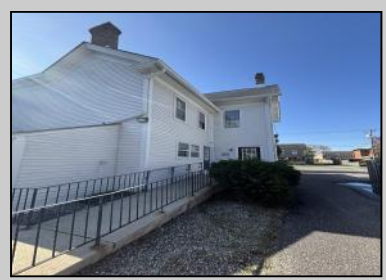
108 Mechanic Cape May Court House, NJ 08210