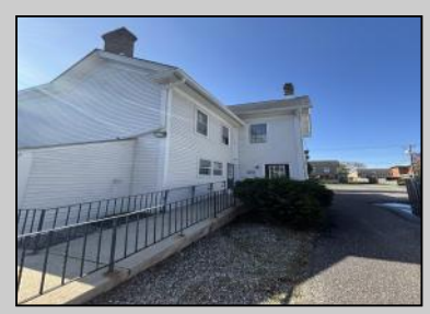
108 Mechanic Cape May Court House, NJ 08210