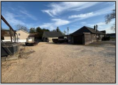
24 Church Cape May Court House, NJ 08210