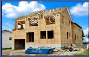
NEW CONSTRUCTION 5 BEDROOM WITH POOL Mid/Late Summer Delivery