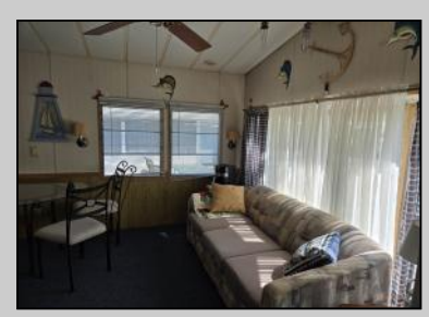
561 Corsons Tavern Ocean View, NJ 08230