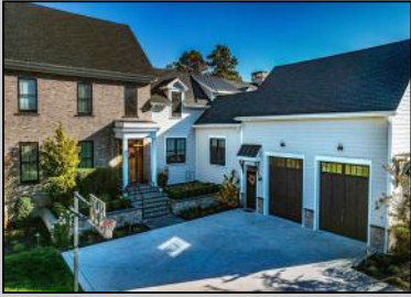
13 Meghan Seaville, NJ 08230