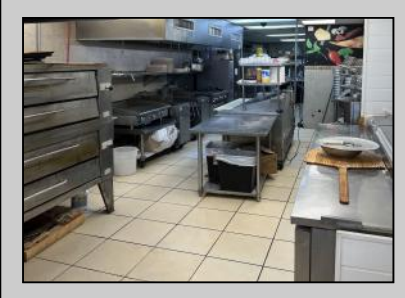
3159 Route 9 South Rio Grande, NJ 08242