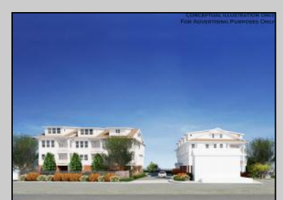
1505 Yacht Cape May, NJ 08204