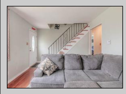
237 Lennox North Cape May, NJ 08204