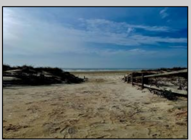
110 45 th Sea Isle City, NJ 08243