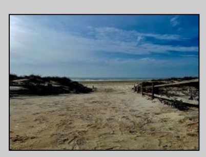
110 45 th Sea Isle City, NJ 08243