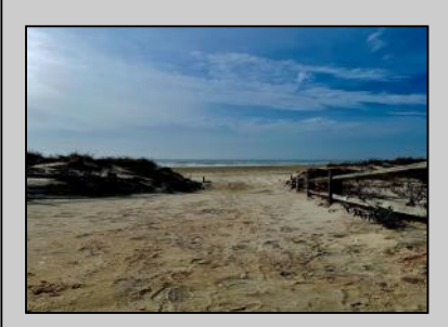
110 45 th Sea Isle City, NJ 08243