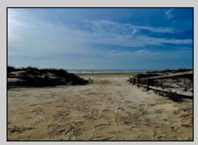
110 45 th Sea Isle City, NJ 08243