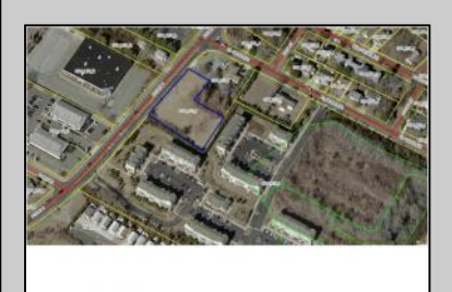
4002 Rte 9 Rio Grande, NJ 08242