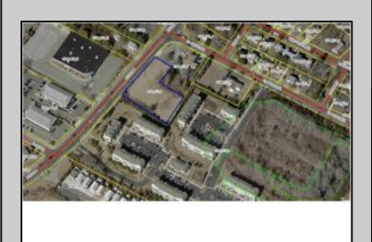
4002 Rte 9 Rio Grande, NJ 08242