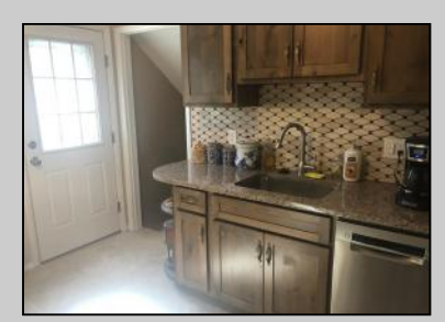
1122 Sunnyside North Cape May, NJ 08204