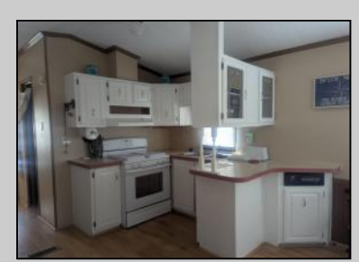
42 West Jersey South Seaville, NJ 08246