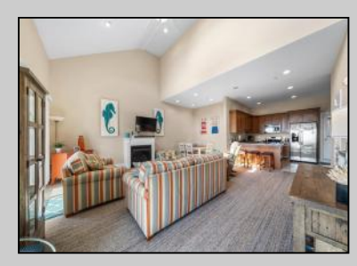
3914 Pleasure Sea Isle City, NJ 08243