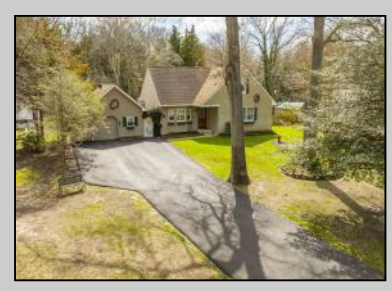
19 Lomurno Cape May Court House, NJ 08210