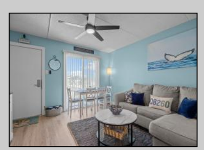
301-309 Ocean North Wildwood, NJ 08260