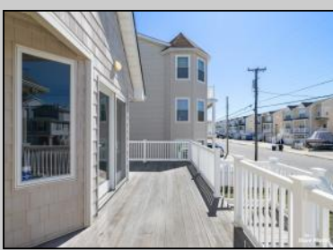
531 Montgomery Wildwood, NJ 08260