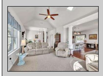
10 Canterbury Cape May Court House, NJ 08210