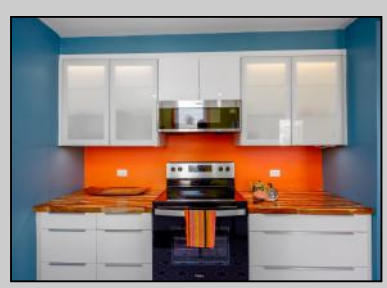
107 Avalon Townbank, NJ 08204