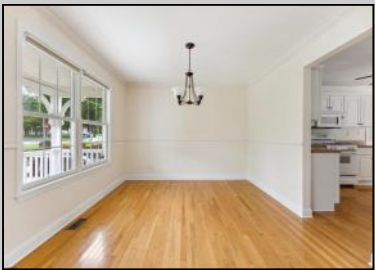
6 Ventnor Beesleys Point, NJ 08223