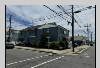
5901 New Jersey Wildwood Crest, NJ 08260