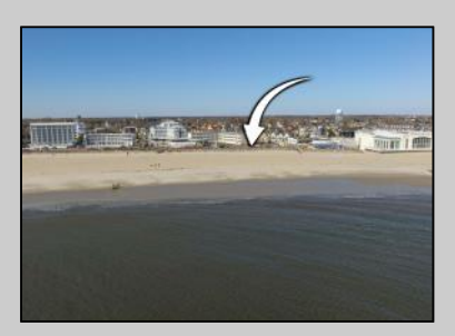
610 Beach Cape May, NJ 08204