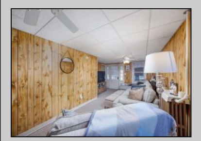
118 Columbine Wildwood Crest, NJ 08260