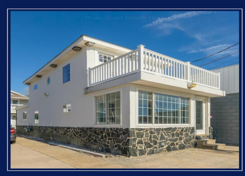
123 E Lincoln Avenue Wildwood, NJ 3 Bedroom 2 Bath Single Family