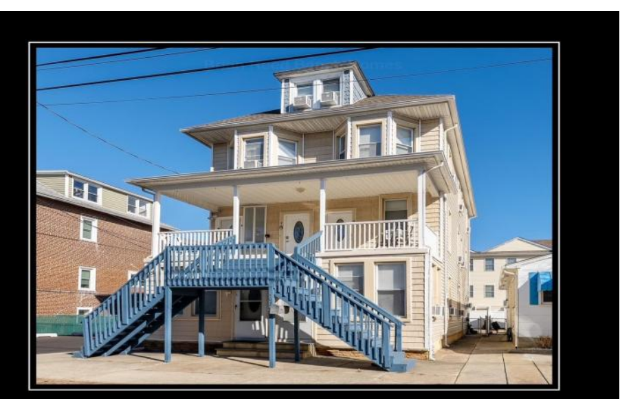
107 E Magnolia Avenue Wildwood, NJ 1st Floor 1 Bedroom Condo