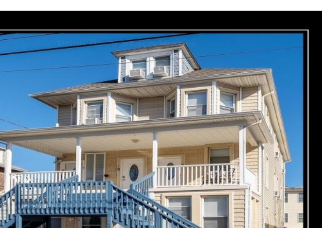
107 E Magnolia Wildwood NJ 6 Bedroom Townhouse