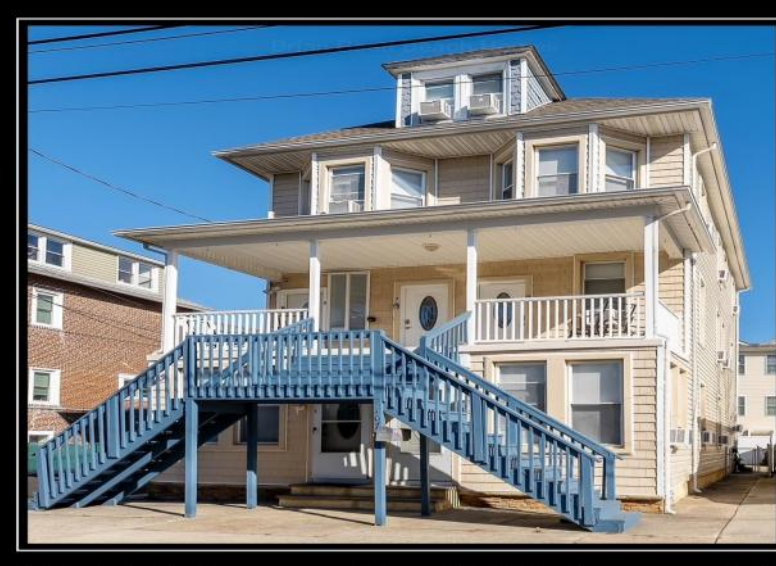
107 E Magnolia Wildwood NJ 6 Bedroom Townhouse