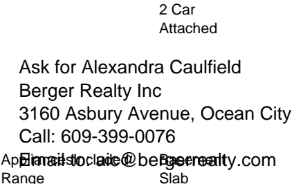
Cooling Central Air Condition