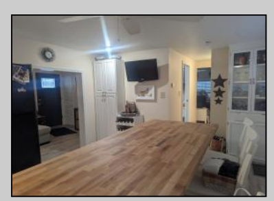
246 West Jersey South Seaville, NJ 08246