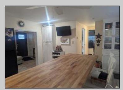
246 West Jersey South Seaville, NJ 08246