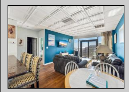
500 Kennedy North Wildwood, NJ 08260