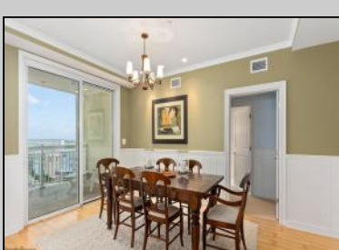
9601 Atlantic Lower Township, NJ 08260