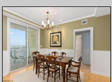
9601 Atlantic Lower Township, NJ 08260