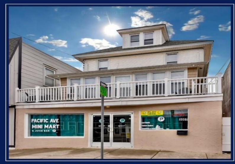
4 BEDROOM TOWNHOUSE AND STOREFRONT 3007 Pacific Avenue Wildwood, NJ